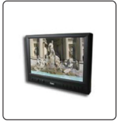
1- V8000w Monitor