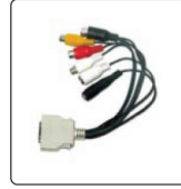
1- A/V Cable