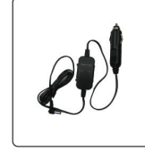
1- Car Adapter