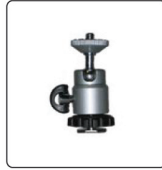
1- Camera Mount