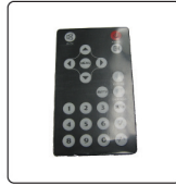
1- Remote Control