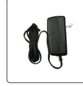
1- AC adapter