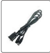
1- VGA Cable