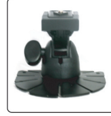
1- Table Stand